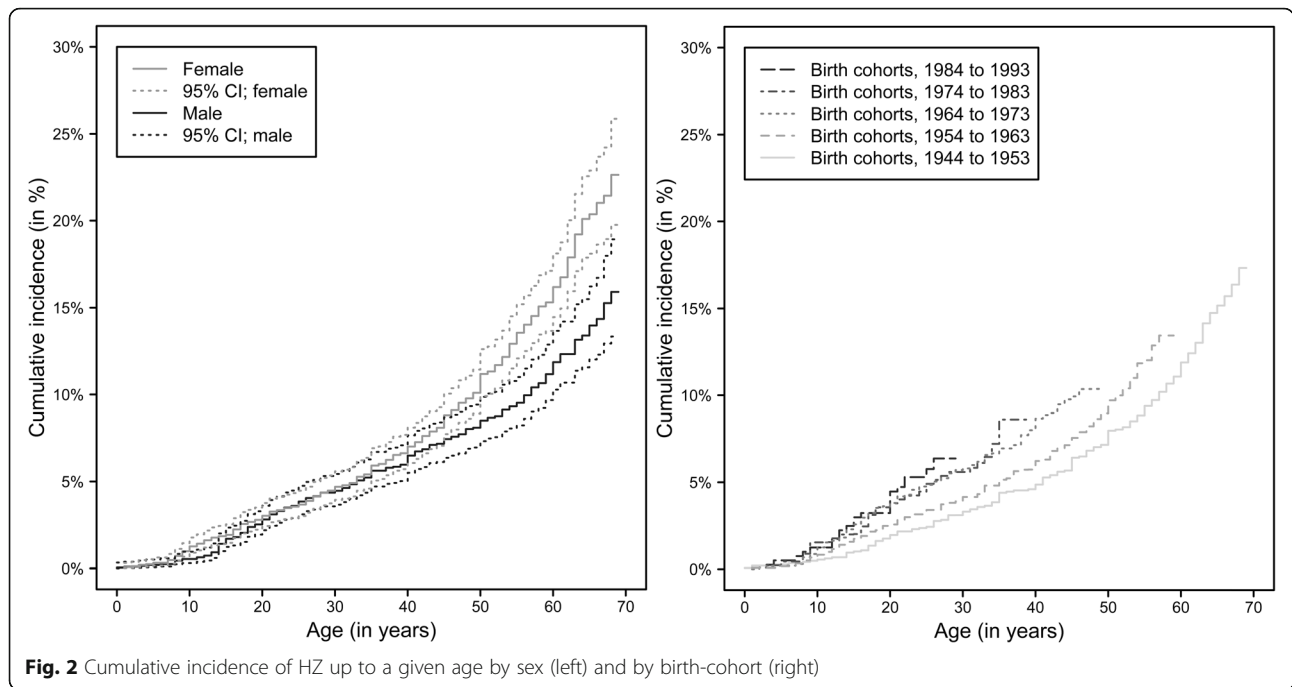
Fig. 2 Cumulative incidence of HZ up to a given age by sex (left) and by birth-cohort (right)

1973) compared to the older birth cohorts (1954 to 1963 and 1944 to 1953) (Fig. 2, right panel).